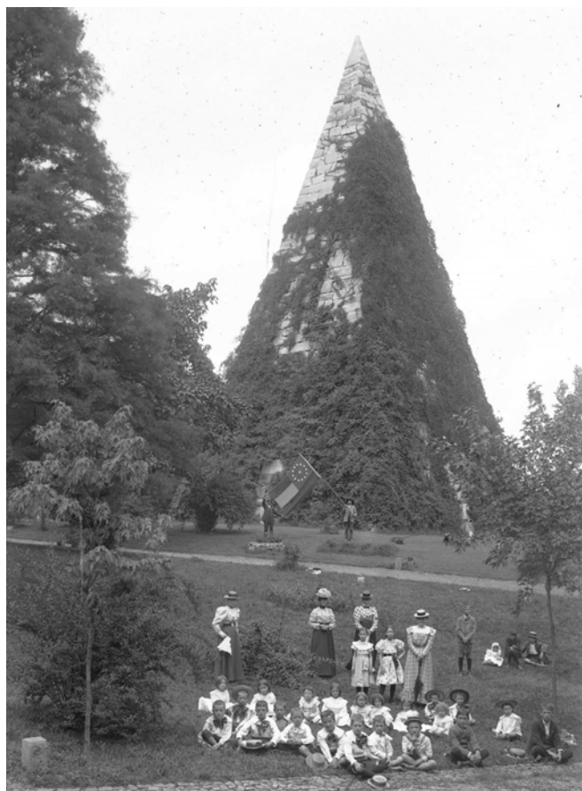
The Pyramid, constructed of blocks of James River granite, was dedicated “To the Confederate Dead” and unveiled in 1869, two years after construction began. This scene depicts an annual Memorial Day celebration in the early 1900’s honoring the dead interred in the Soldier’s Section (estimated at 18,000 individuals, including 3,000 reinterred in Hollywood from the battlefields of Gettysburg).