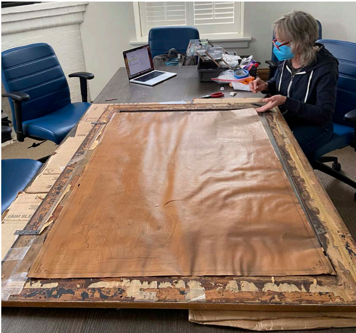
One of two original maps of Hollywood Cemetery being examined initially on site before removal for extensive restoration and preservation by Richmond Conservators of Works on Paper