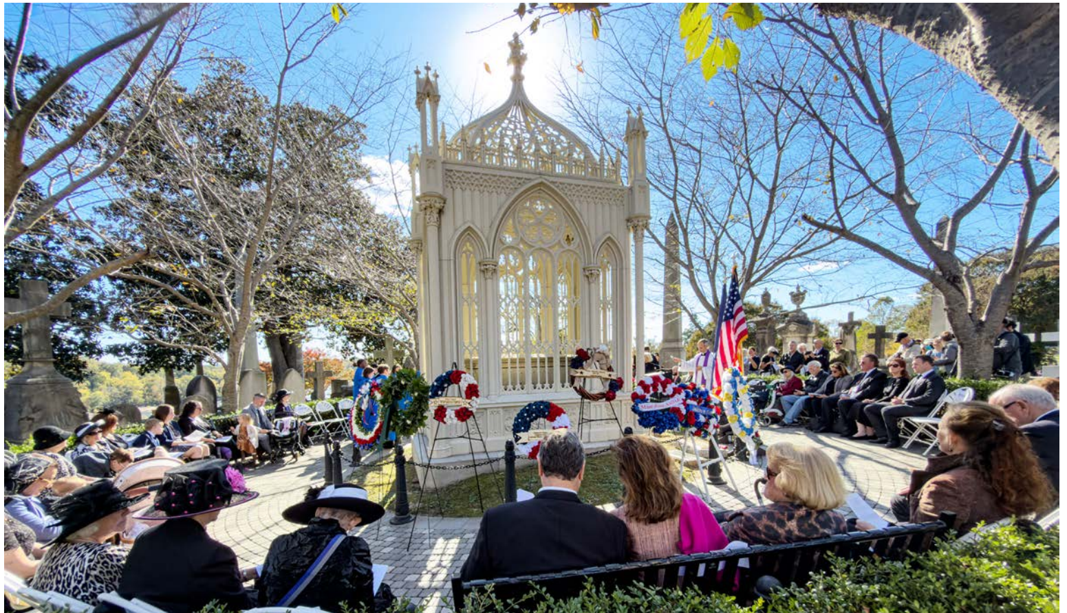
A large gathering attends the reinterment ceremony of President Monroe's daughter, Eliza Monroe Hay, in Presidents' Circle. The "birdcage" in the center of the photograph contains her father's sarcophagus and is surrounded by the markers of other family members.

NONPROFIT ORG. U.S. POSTAGE PAID PERMIT NO. 671 23232